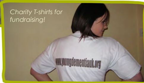
Charity T-shirts for fundraising!

Please help make sure YDUK continues being alongside through the difficult times, and sharing enjoyable times too. And if you are not already a Friend, do consider joining – the minimum subscription is £25 for the year. To join, contact 01993 776295 or mail@youngdementiauk.org