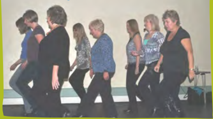
Line dancing proved a hit at the Café

We hope March will bring hints of spring, with a March Hare and Mad Hatter inspired tea party with favourite teatime treats and some fantastic hats. Hopefully we'll go home grinning like Cheshire cats!